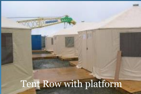
Tent Row with platform