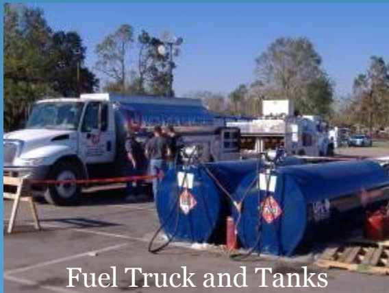
Fuel Truck and Tanks