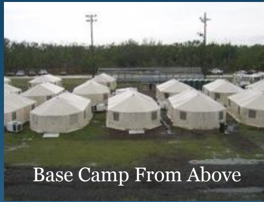
Base Camp From Above