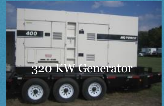
320 KW Generator

Turn-Key Base Camps Power Generation/Distribution HVAC Systems Light Towers Fuel Service Identification Carding/Badges Recreation Facilities Containerized or Soft-sided Resources Housing Facilities Command and Office Facilities Potable, Gray & Black Water Services Kitchen and Food Prep Facilities Shower Facilities (with ADA) Laundry Facilities