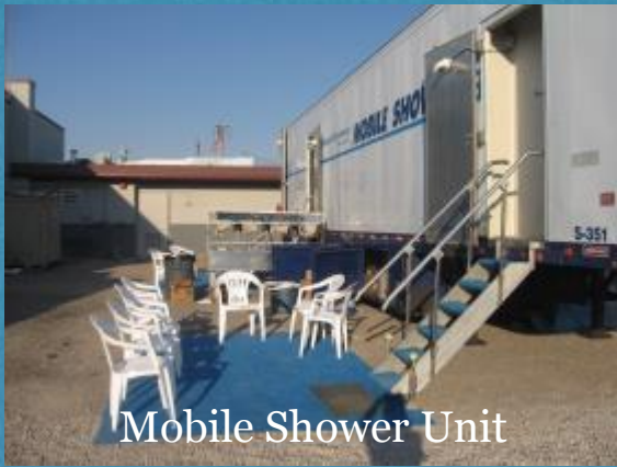
Mobile Shower Unit