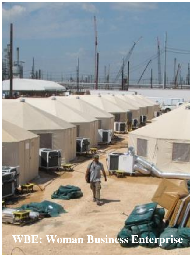
WBE: Woman Business Enterprise