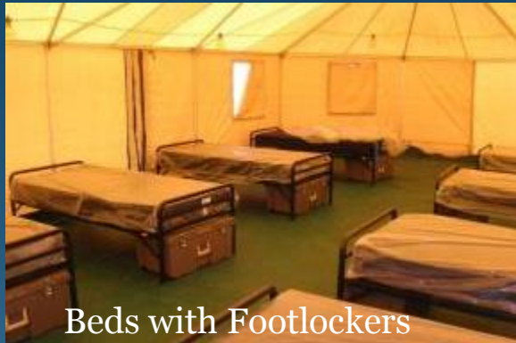
Beds with Footlockers