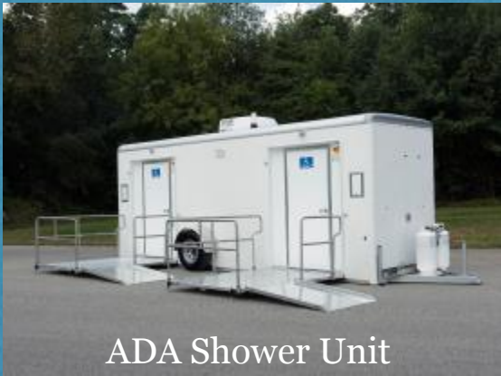
ADA Shower Unit